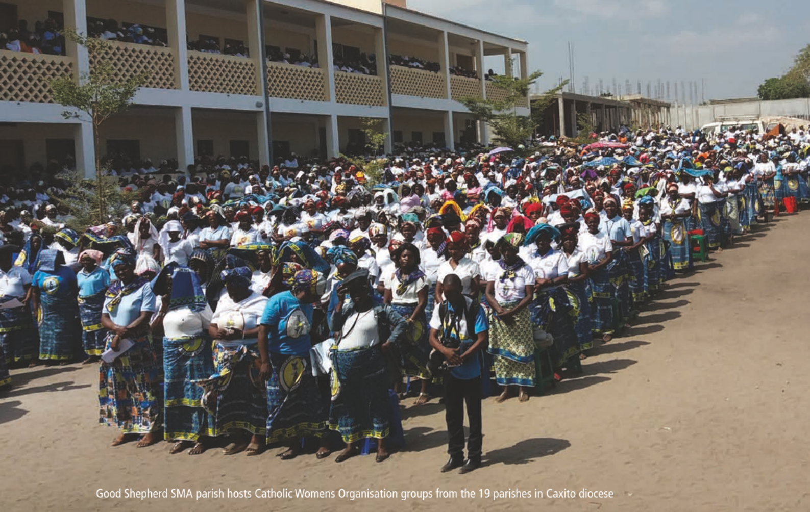
Good Shepherd SMA parish hosts Catholic Womens Organisation groups from the 19 parishes in Caxito diocese