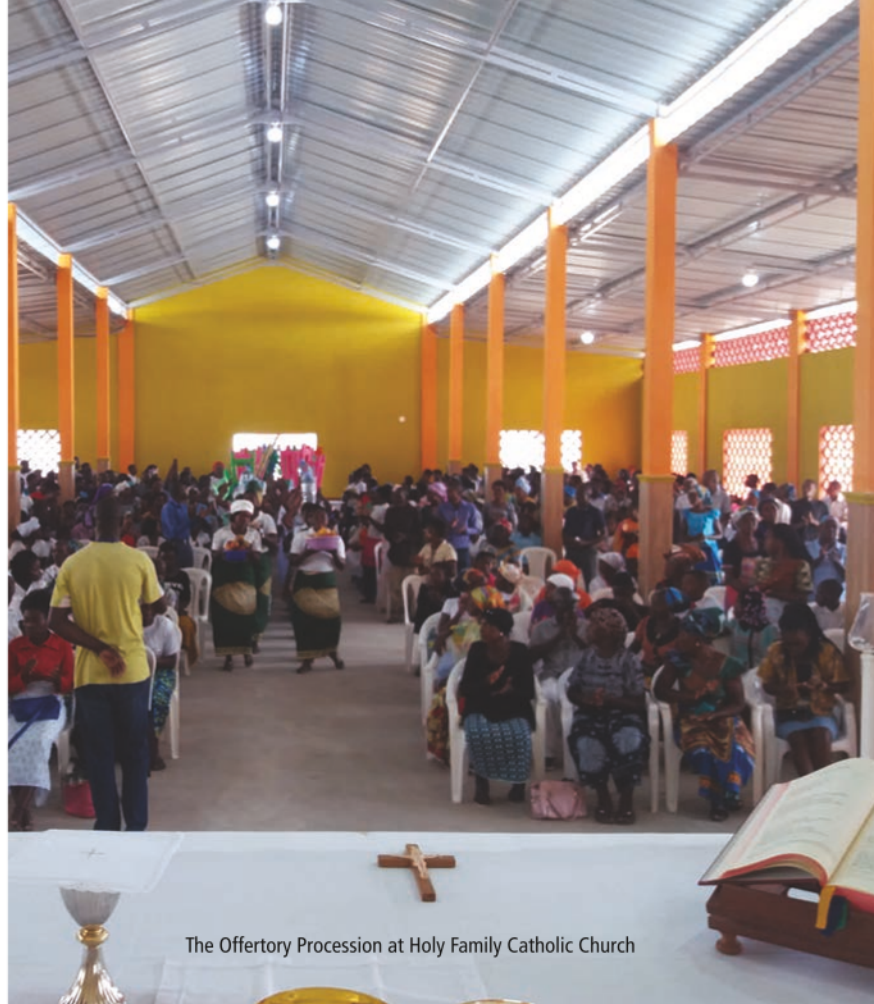
The Offertory Procession at Holy Family Catholic Church