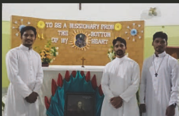
Three SMA theologians in Mangadu

Whilst vocations to the priesthood are declining in southern India, there is an increase in the northern states. Perhaps we will need to fish in new waters. There are challenges in recruiting suitable candidates for our Society: educational and job opportunities have improved in India; smaller family units; challenging young men during their formation is often seen not as opportunities to grow but as unacceptable criticism etc. The political situation is not favourable to non-Hindu groups (such as Christians and Muslims).