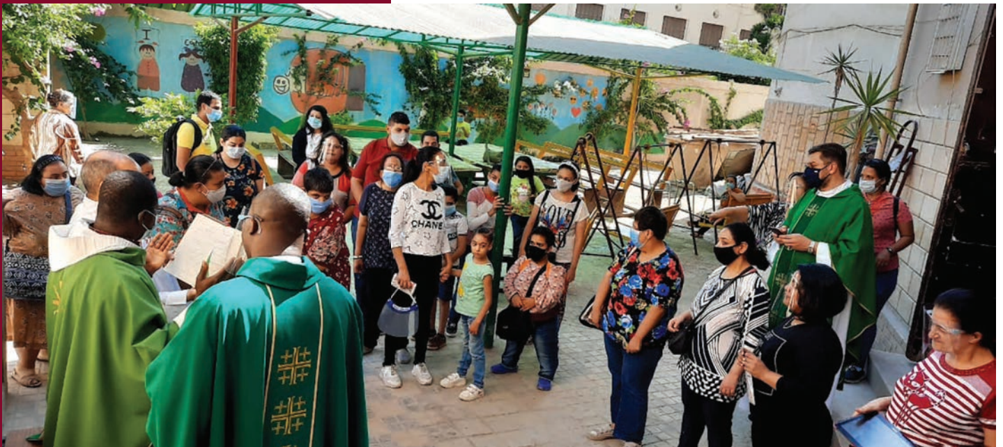
Mass to celebrate the reopening of the school in October 2020